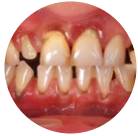
Diseased & infected gums