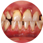
Diseased & infected gums