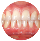
Healthy teeth & gums